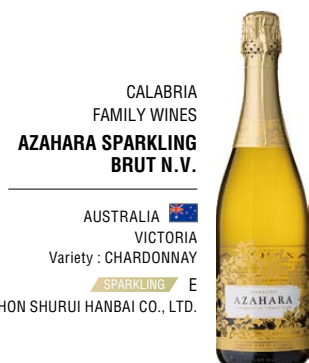
CALABRIA FAMILY WINES AZAHARA SPARKLING BRUT N.V.

ARMENIA - Variety : VOSKEHAT B THE ANCIENT WORLD LTD.