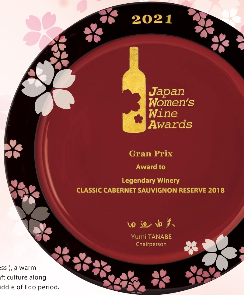
Creating a contest trophy with KISO SHIKKI_image