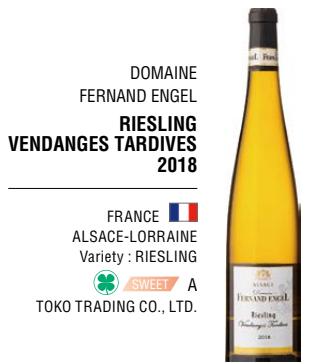
DOMAINE FERNAND ENGEL RIESLING VENDANGES TARDIVES 2018

FRANCE - Variety : GRENACHE E FIRADIS LTD.